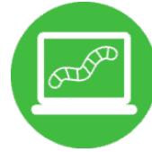
Phishing & Malware Infected Sites