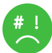
Suicide & Self-Harm