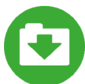
Filesharing & Hacking